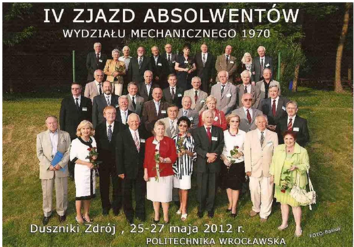
Picture 5. Collective photograph of participants of IV Reunion 1970 year graduates from the Department of Mechanical Engineering at the Technical University of Wrocław, Poland. Duszniki-Zdrój 25 to 27 May 2012.